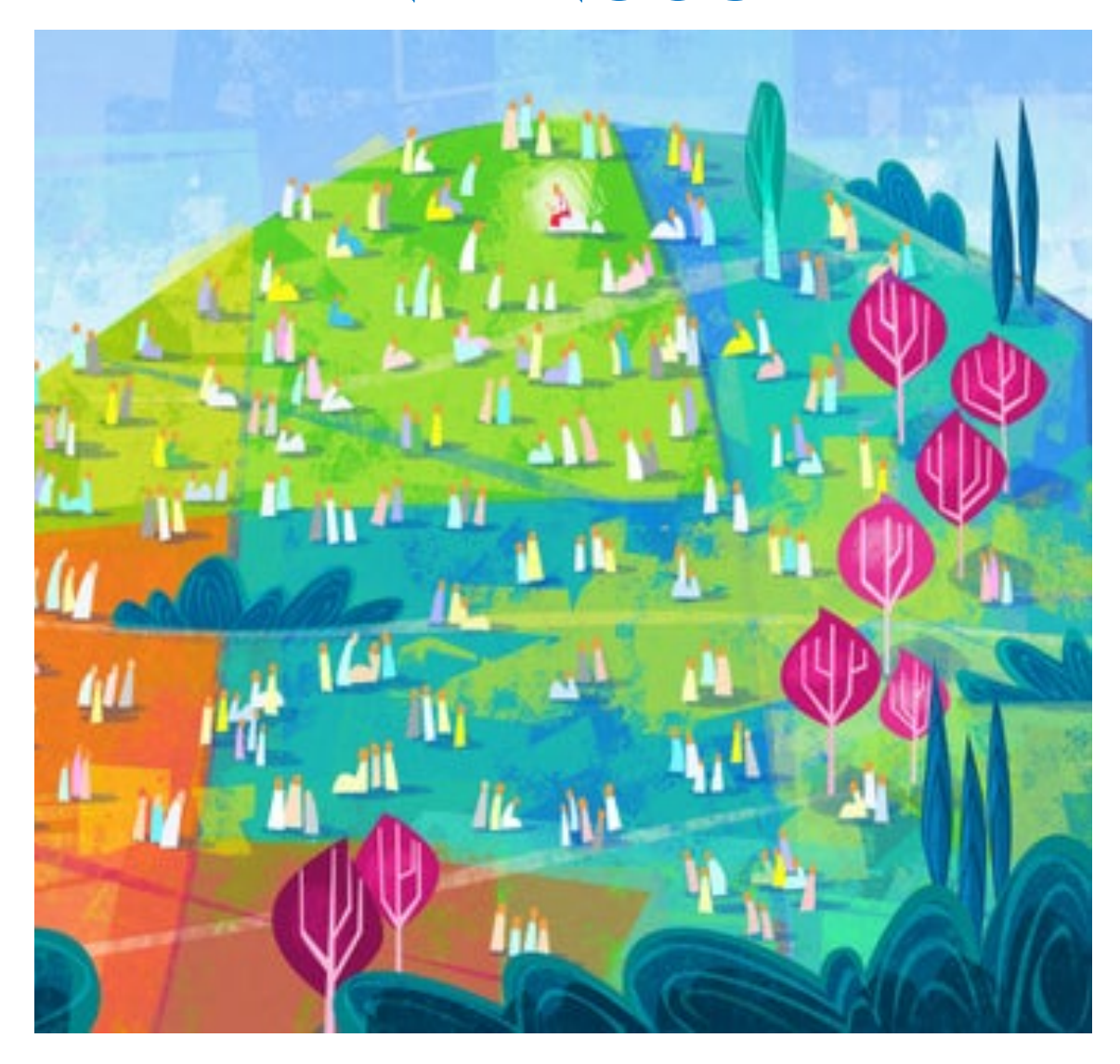
AT-HOME GUIDE FOR FAMILIES September 20, 2020