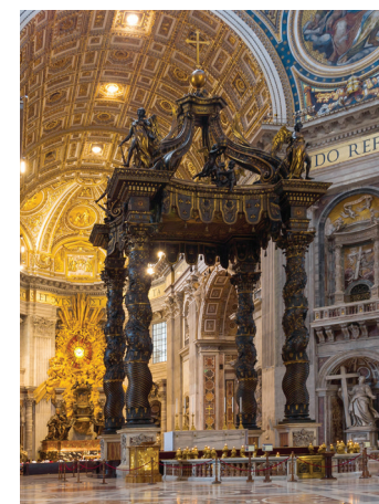
Saint Peter's Baldachin, Vatican

These most-seen pieces beckon us to the rest. His artistic career – sculptor, architect, painter, set designer -- spanned seventy years, from childhood to shortly before his death at age 82.