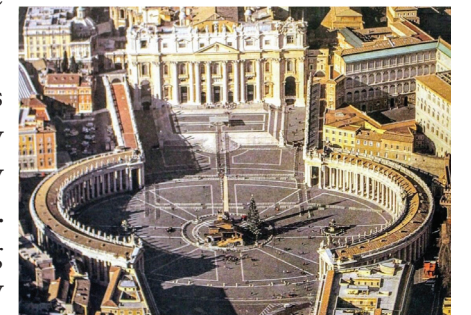
Aerial view of St. Peter's Square, Rome

St Teresa is unmistakably rich in theology and devotion. As a starting point, its beauty testifies to