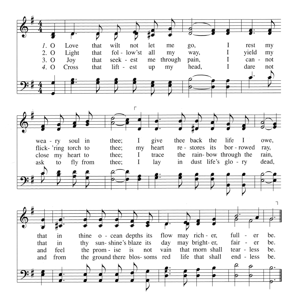
*Prayer of Invocation