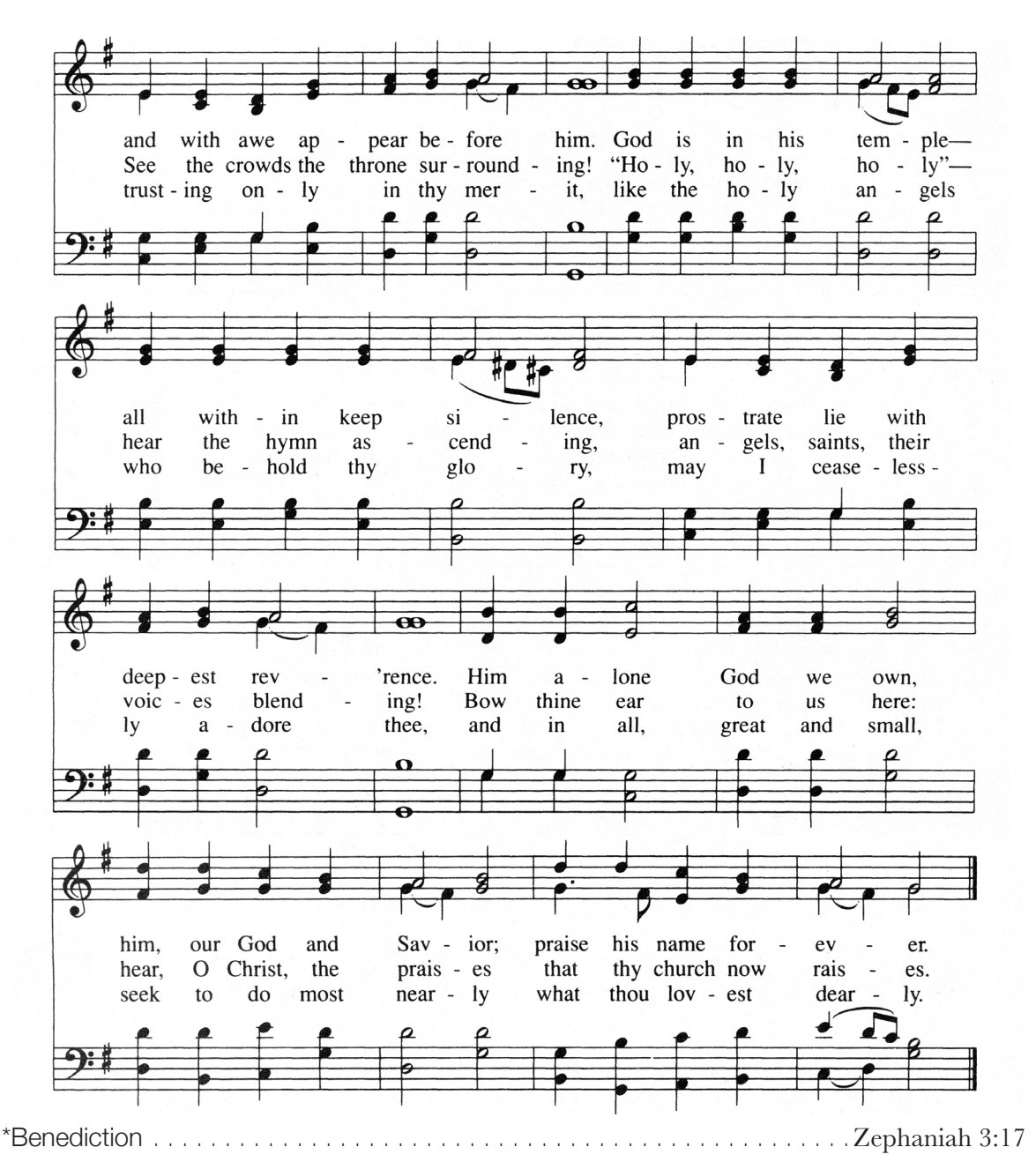
The LORD your God is in your midst, a mighty one who will save; he will rejoice over you with gladness; he will quiet you by his love; he will exult over you with loud singing. Amen .