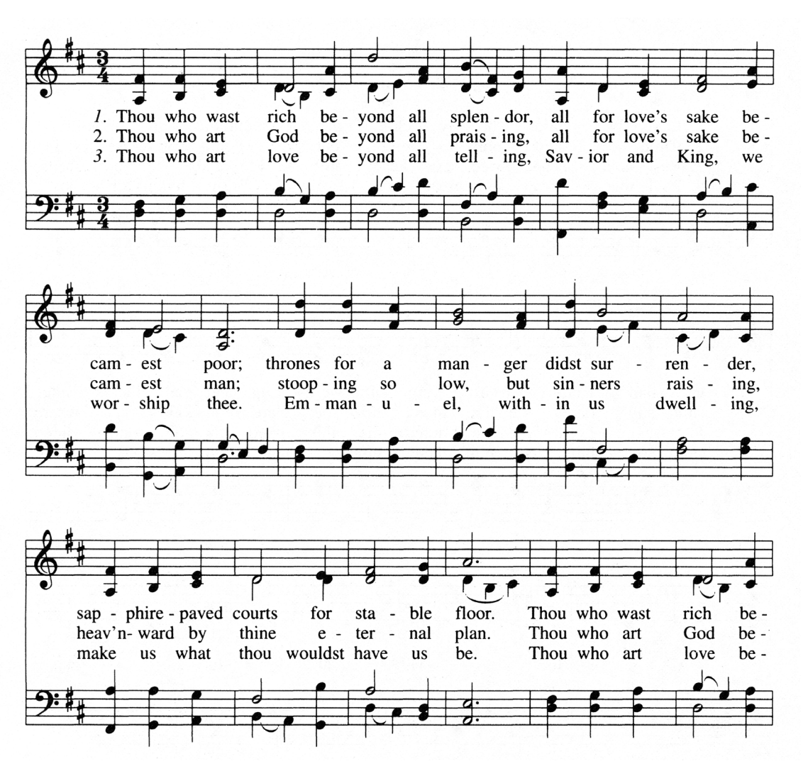
Thou Who Wast Rich beyond All Splendor