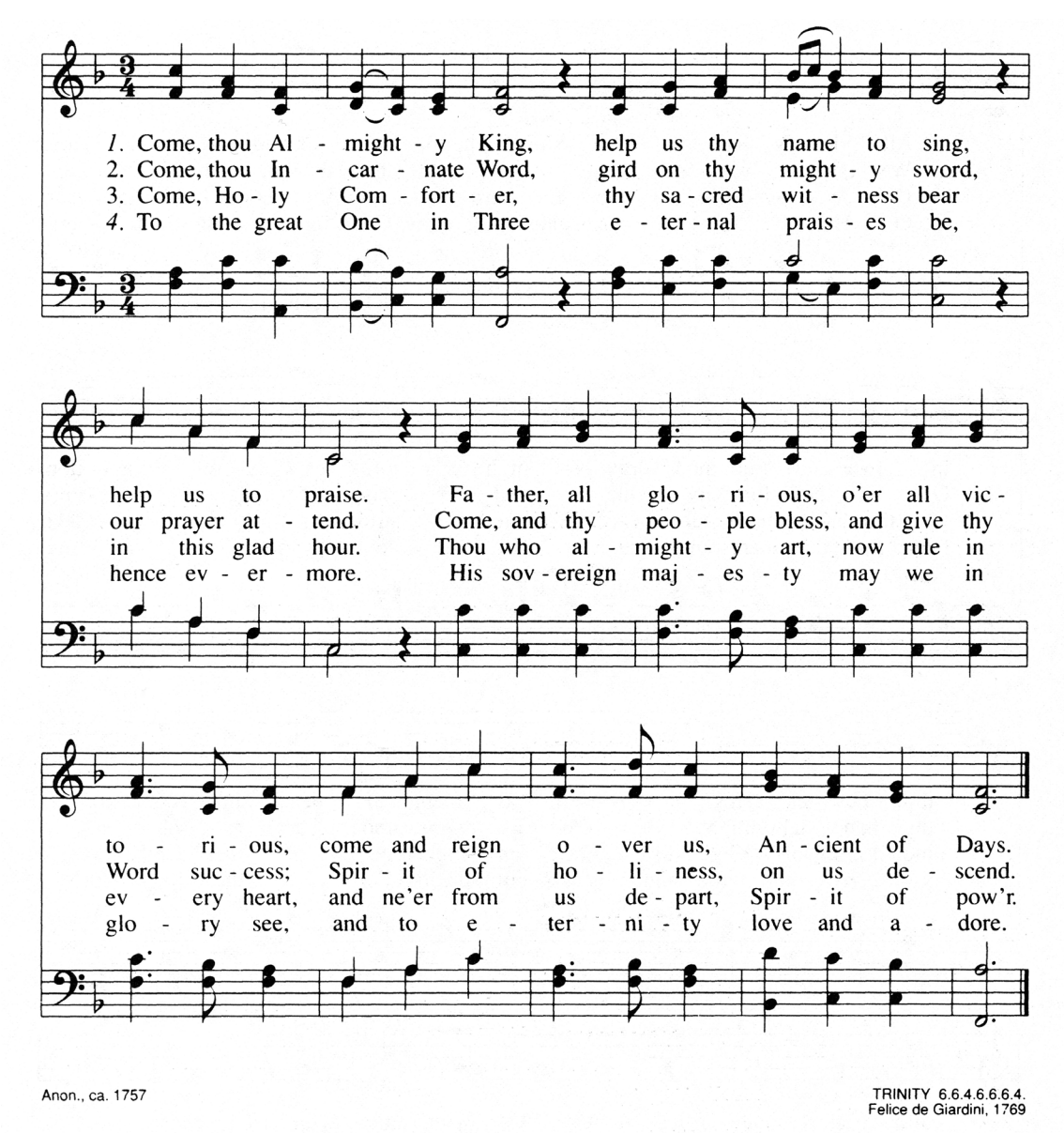
Copyright 1990 Great Commission Publications CCLI# 11505634