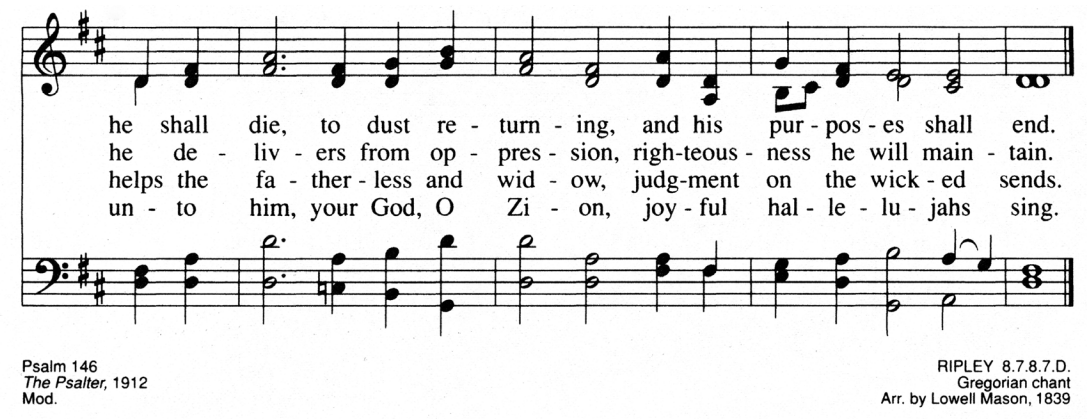
Copyright 1990 Great Commission Publications CCLI# 11505634