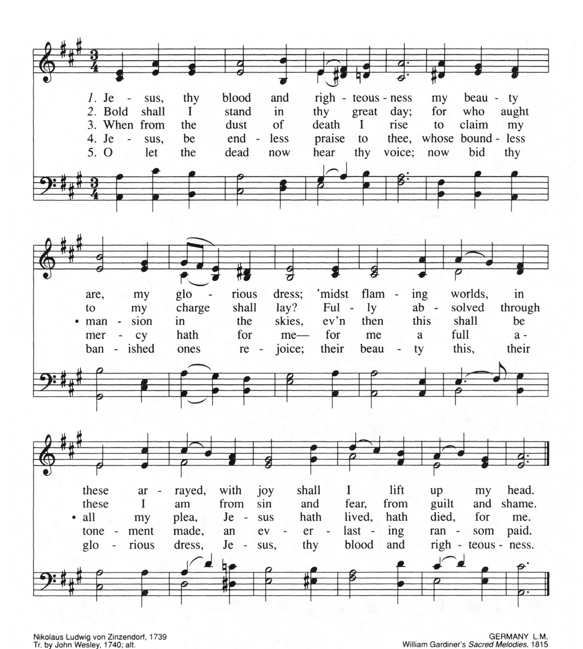
Copyright 1990 Great Commission Publications CCLI# 11505634