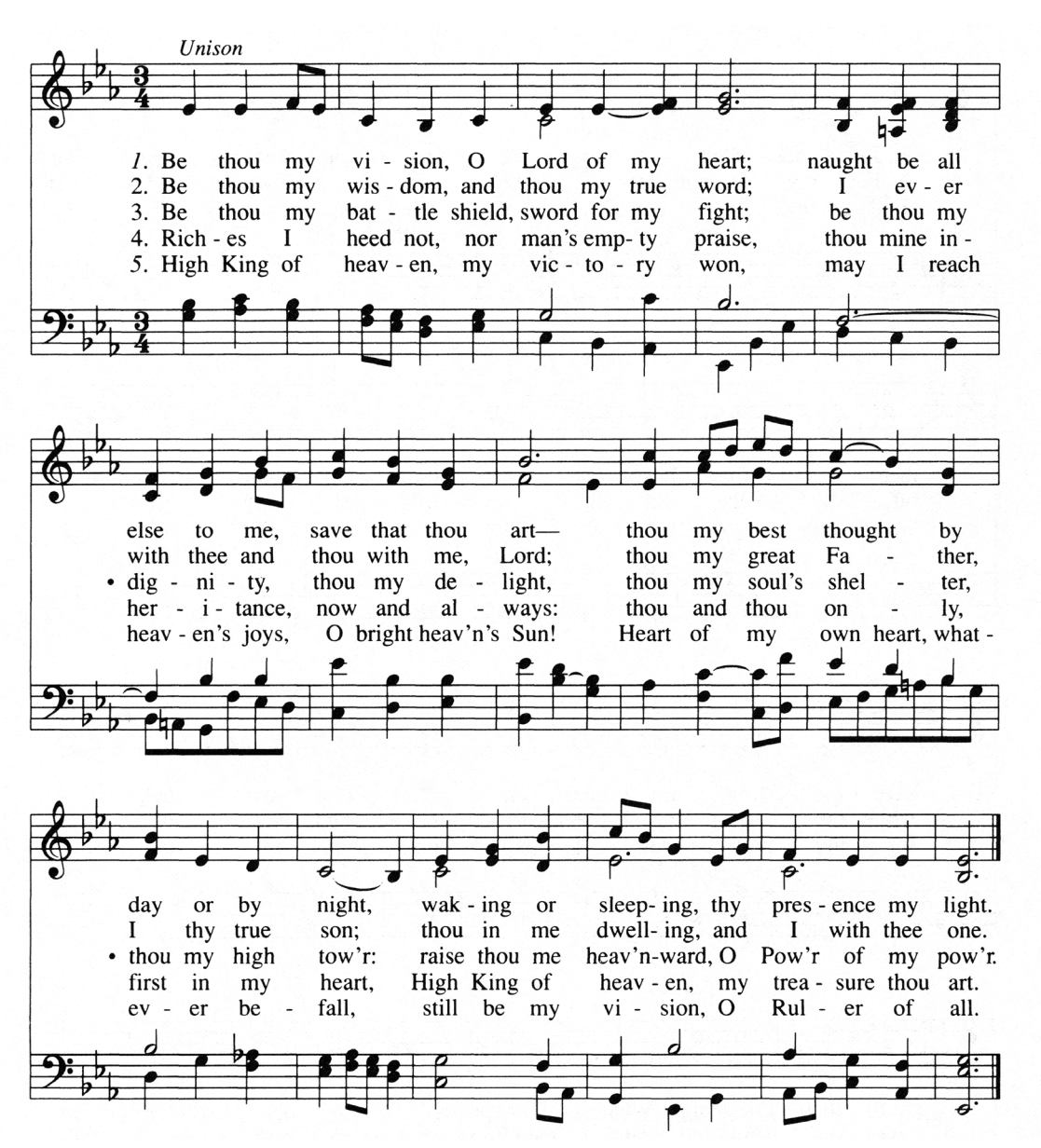
Copyright 1990 Great Commission Publications CCLI# 11505634

*Hymn of Love to Christ...... Trinity Hymnal, 642 *Be Thou My Vision