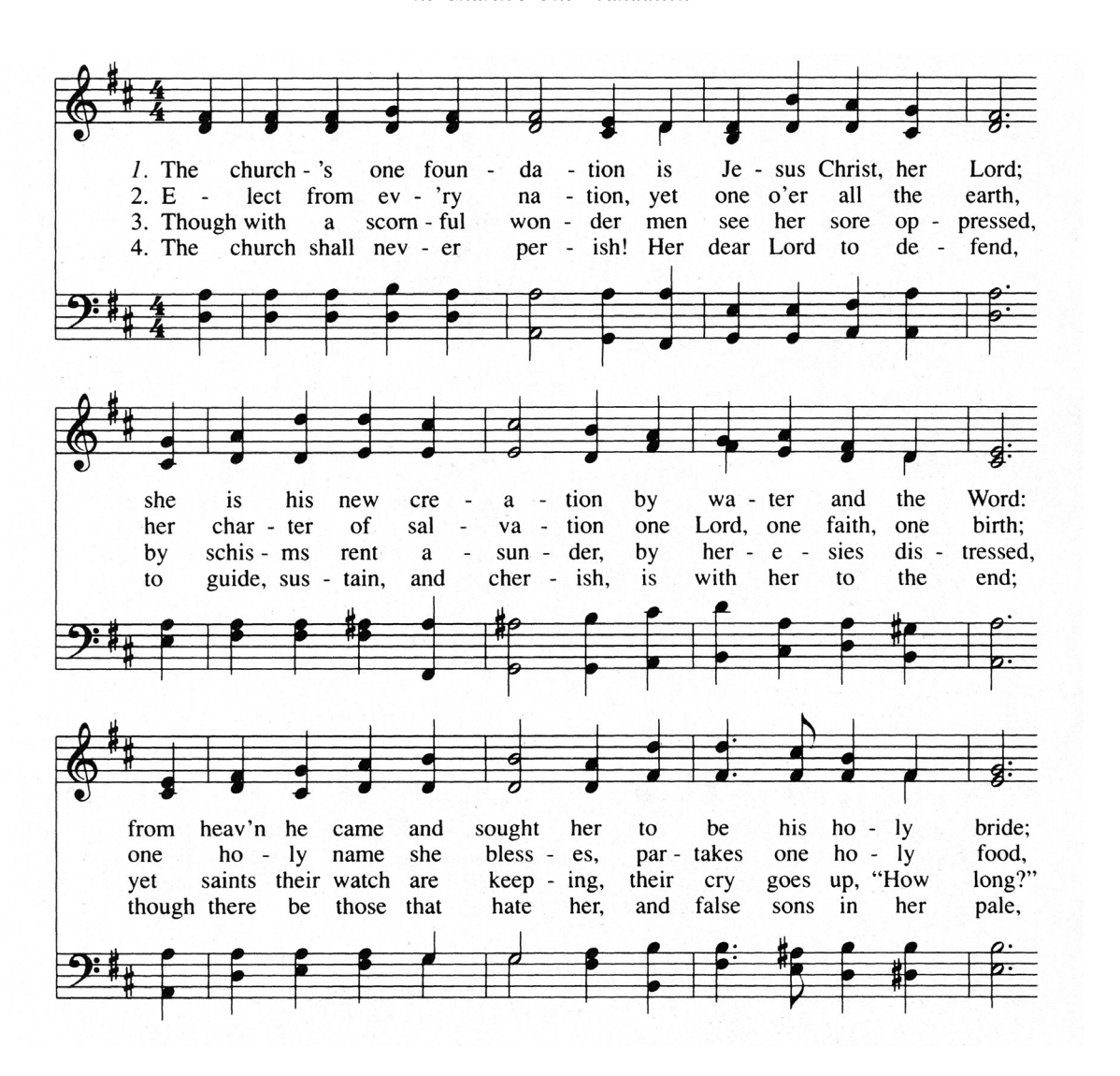
The Church's One Foundation