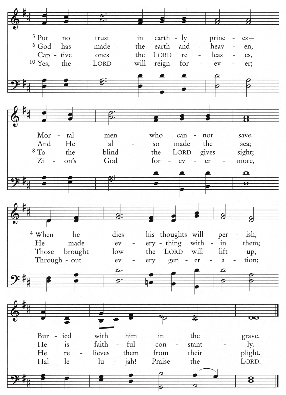
Tune: RIPLEY 87.87.D. Gregorian chant; arr. Lowell Mason, 1839