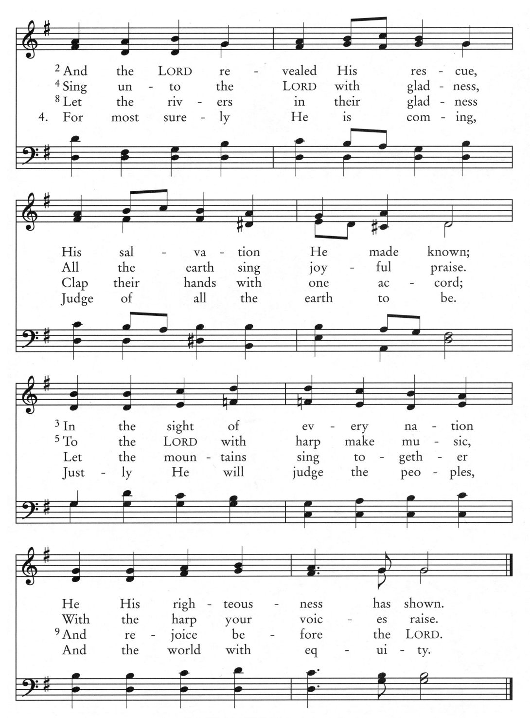
Tune: ODE TO JOY (87.87.D), Ludwig van Beethoven