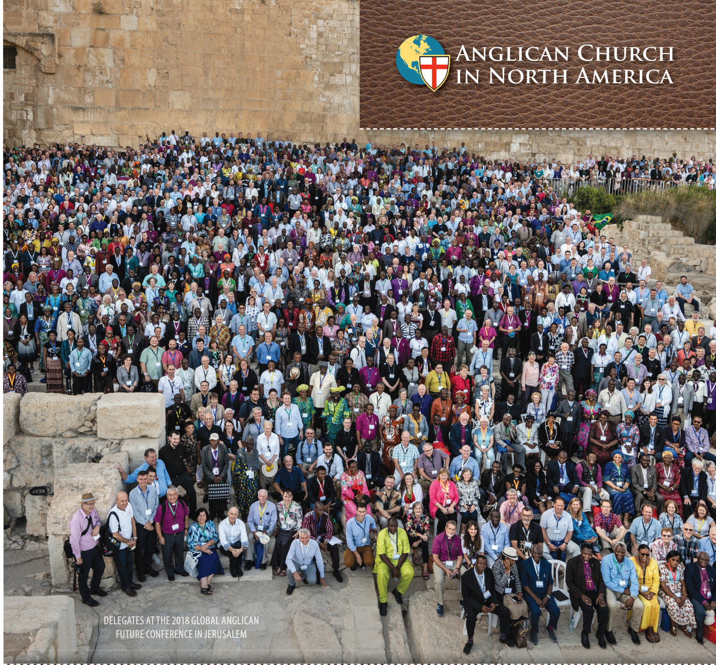
DELEGATES AT THE 2018 GLOBAL ANGLICAN FUTURE CONFERENCE IN JERUSALEM