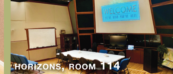
HORIZONS, ROOM 114