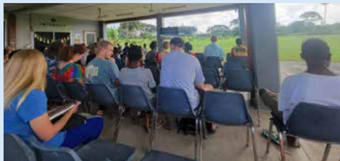
Our classroom has a nice view!