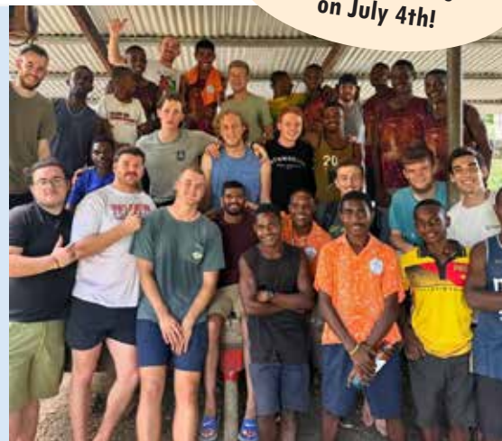
The men of the interface team along with some of the Christian School students

If you want to picture and learn more about the Yifki, here's a great report with photos from MAF (Mission Aviation