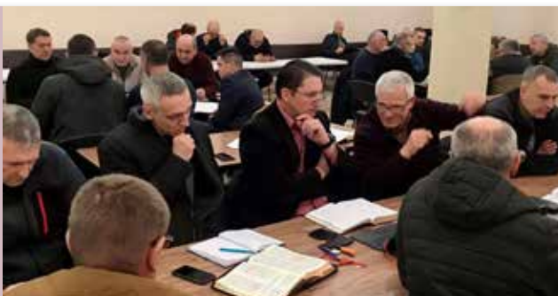
Pastors in Zaporizhzhia, Ukraine meeting together

The ministry of Zaporizhzhia Bible Seminary (ZBS) in Ukraine is expanding. This school year we have our largest student enrollment in a decade. Courses are taught on the campus, in two locations in western Ukraine, and one new location in Germany where there are a lot of refugees from Ukraine who want Bible and theology training. We are glad for prayers for safety on the campuses, for students to learn lessons well even while under pressure of attacks at any time, and for souls to be saved throughout the country.