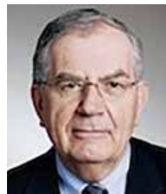
Sinclair B. Ferguson

If you choose to participate virtually, you may join at any time after 8:45 a.m. from your computer, iPad, or cell phone via the internet by clicking on the following link: https://zoom.us/j/2062432600 . When you are prompted for a pass code, use 2600.