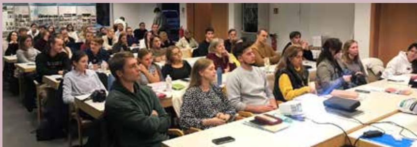
At right: ZBS Class in session in Germany