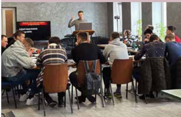
ZBS course in Old Testament, Western Ukraine campus