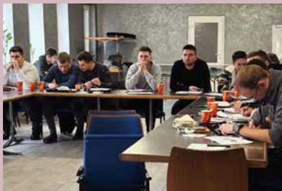
ZBS students in western Ukraine - course in Homelitics