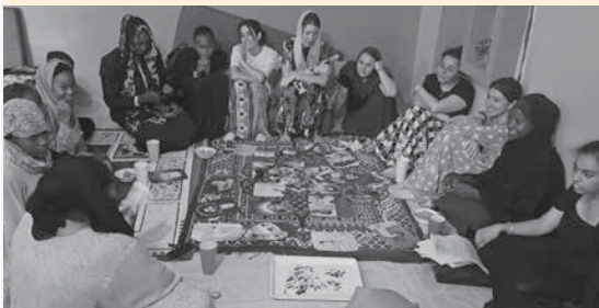
Hosting a special women's event for ladies at the English Center while the short-term team from Egypt was here with us.

In the months since I last wrote, there has been much of normal life and responsibilities...but there have also been some unique experiences. Some of what's been happening includes hosting the ladies from my church for a meal