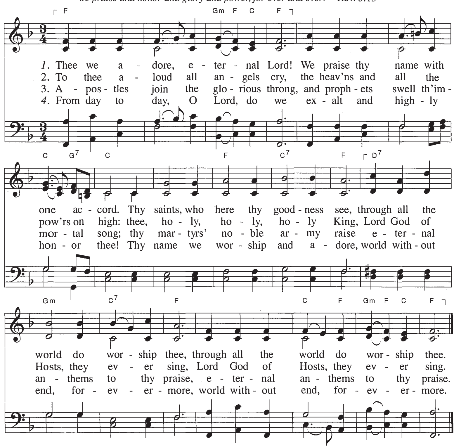
I heard every creature ... singing: "To him who sits on the throne and to the Lamb be praise and honor and glory and power, for ever and ever!" Rev. 5:13