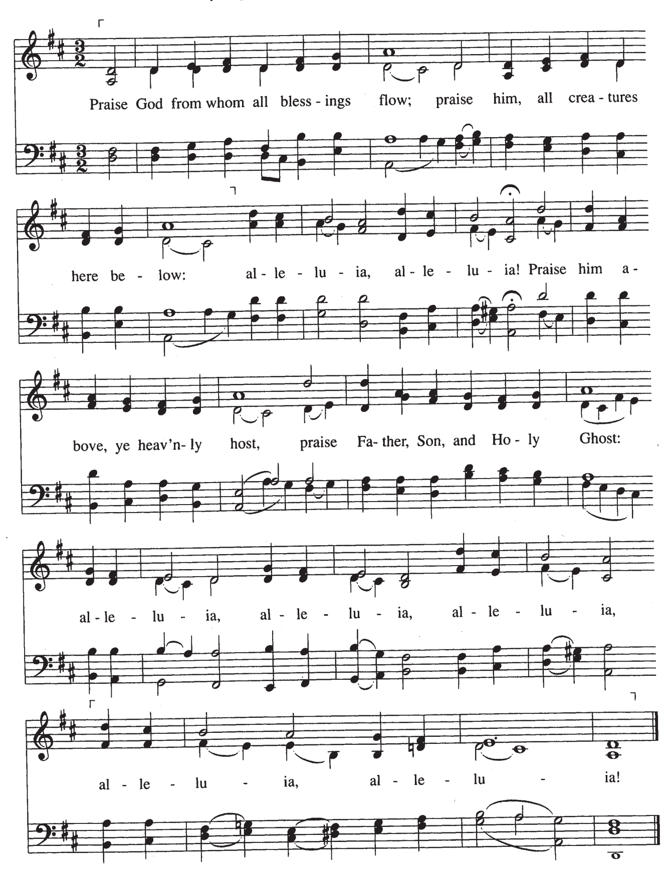
Let everything that has breath praise the LORD. Ps. 150:6