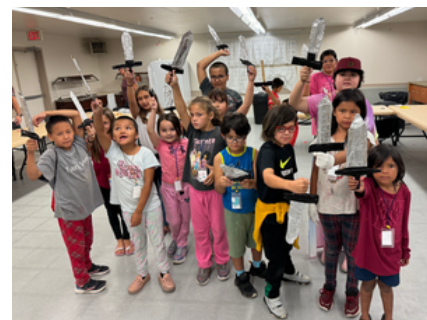
The Armor of God – The Sword of the Spirit!