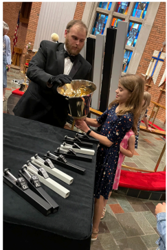
Spring Concerts: Concordia University Wisconsin Kammerchor and The Gateway Ringers