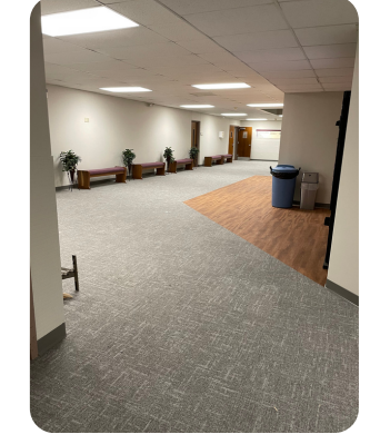
New flooring installed in April of 2023.

In the next few years, Chapel will probably need to replace the roof over the upper level of the church. And I'm sure you've noticed that we recently re-carpeted the lower level and are probably wondering when we're going to do the upper level. But before any of that, we need to make some significant repairs to the parking lots. Would it surprise you to learn that the cost of each of these projects is over $100,000 individually?