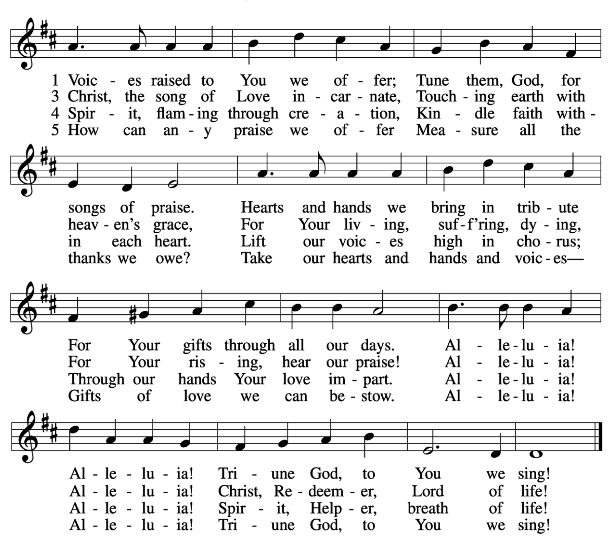
795 Voices Raised to You, We Offer

Text: © 1997 GIA Publications, Inc. Used by permission: Chapel of the Cross no. VVPKL-GBOIT-LYVDV-EKAFZ Tune: © 1996 Carolyn Jennings. Used by permission: Chapel of the Cross no. VVPKL-GBOIT-LYVDV-EKAFZ