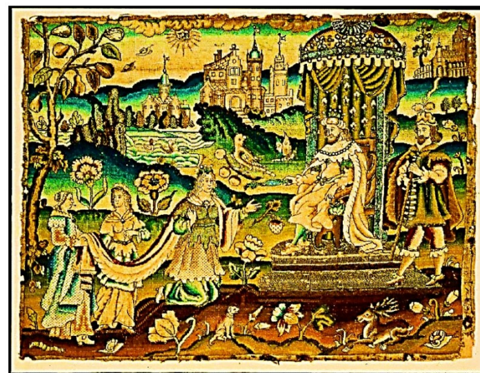
Divine Deliverance from Death to Life in Escher's

Scan this QR code for Online Giving, Visitor Information and Prayer Requests