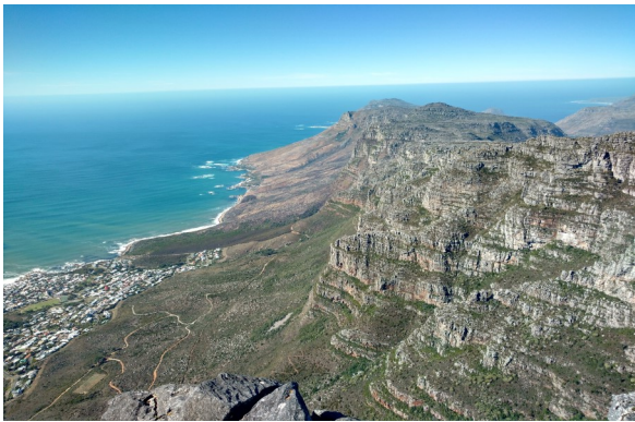
We took a break from the conference to go to Table Mountain. What a view!

In May I [Steve] attended MAF's Africa Managers' Conference. MAF managers and spouses from Congo, Mozambique and Lesotho were present at Monkey Valley (a conference center) in Cape Town, South Africa. My part was to explain MAF's Safety and Quality process – Find It, Fix It, Check It. As an example, "it" can be a hazard, like bushes growing too close to an airstrip that might catch the wing of an airplane landing or taking off. The hazard is identified and reported (Find it), the bushes are cut back (Fix it), and four months later, someone determines if the bushes have again become a hazard (Check it). It takes diligence on everyone's part to keep safety a priority in all that we do.