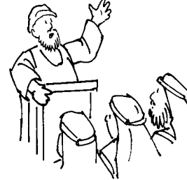
Zecha R iah

Arrange the bold letters in the blanks to complete the sentence.