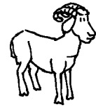
a male sheep

Write a 3-letter name for each picture. Use the letters to finish the verse.