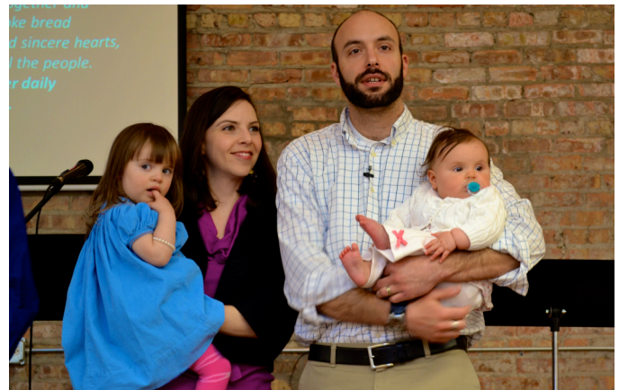
Our family officially joined Living Hope Church on Sunday, April 21 st .