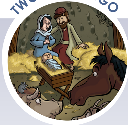
The Son of Man is born in Bethlehem Luke 2:1-20