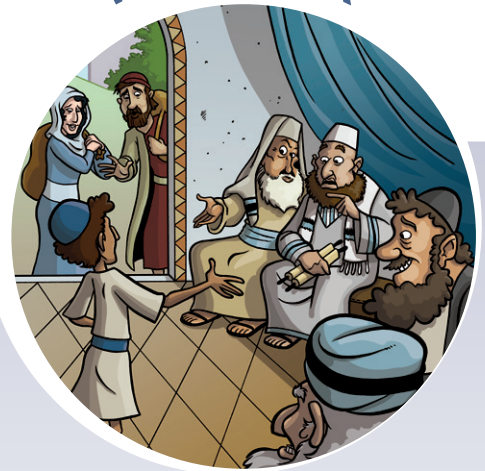
The Son of Man is identified in the temple Luke 2:39-52