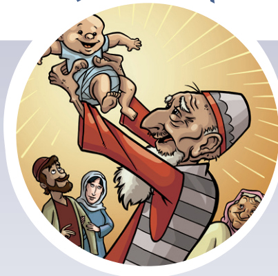
The Son of Man is presented in Jerusalem Luke 2:21-38