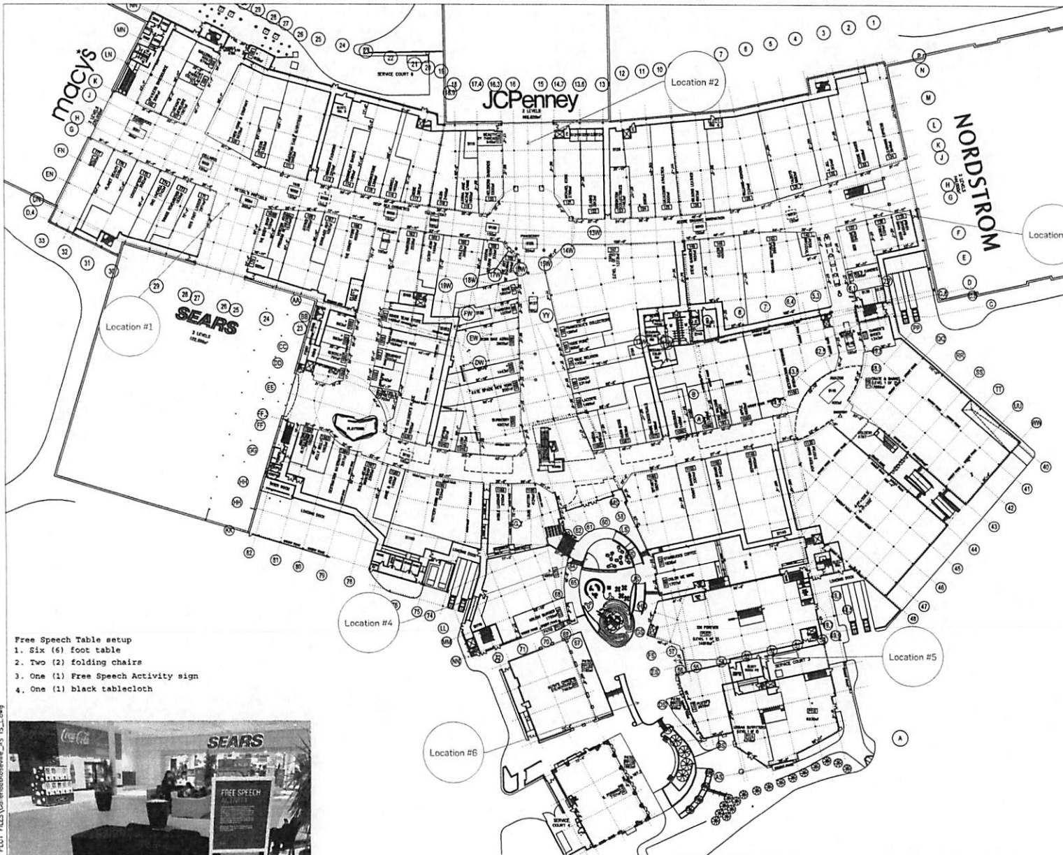
Exhibit B - Designated Areas