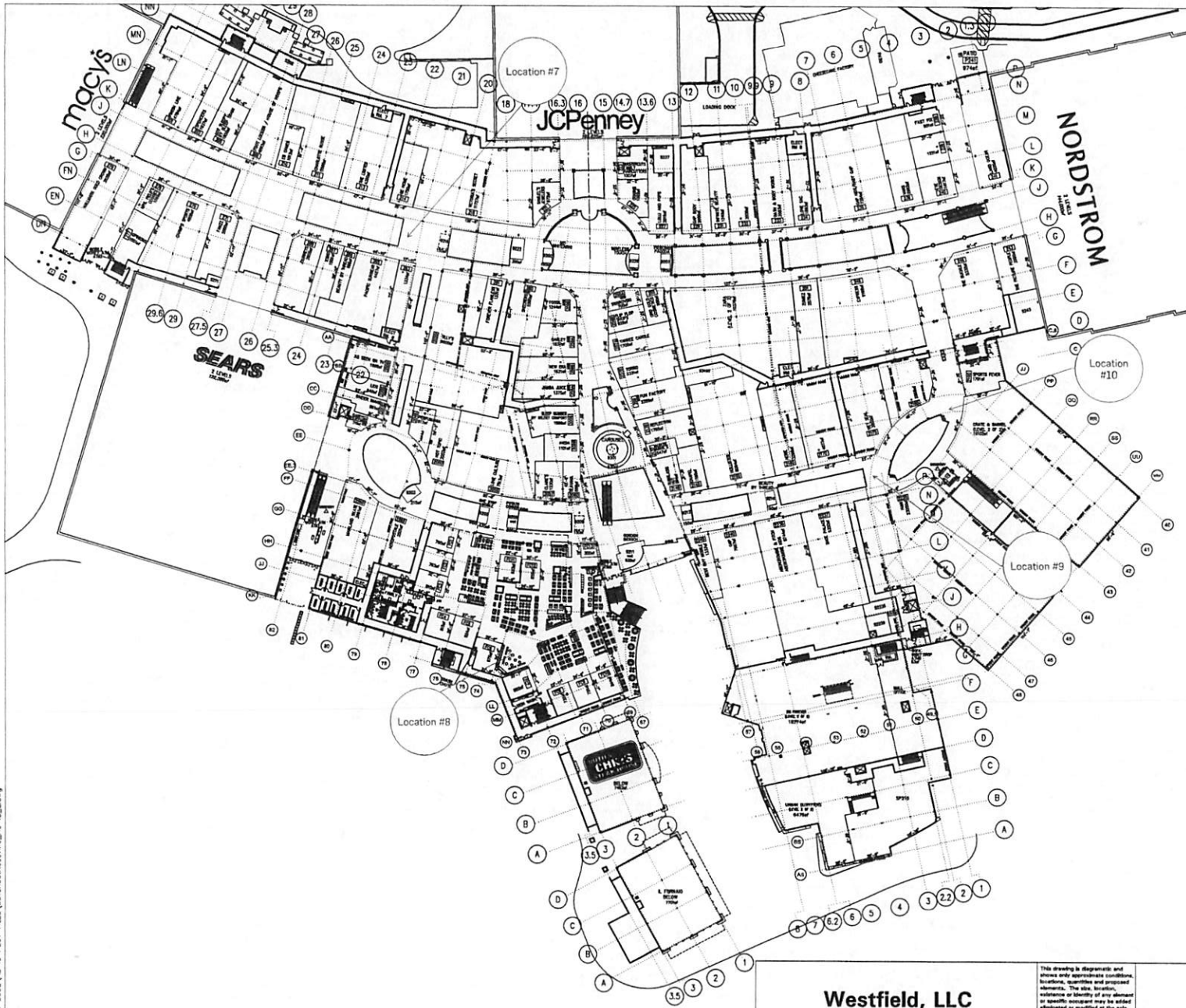
Exhibit B - Designated Areas

T:\V_PLOT FILES_2021\MS IS PLOT FILES\GalleriaatRoseville_45_05_L.dwg