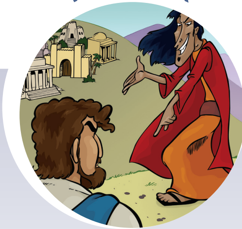
Jesus overcomes temptation Luke 4:1-13