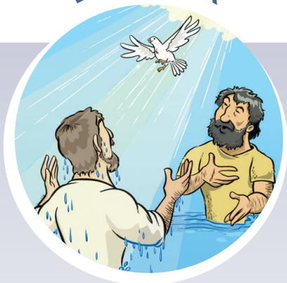
John baptizes Jesus Matthew 3:13-17