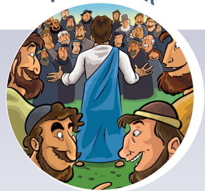
Jesus calls the disciples Mark 1:16-28