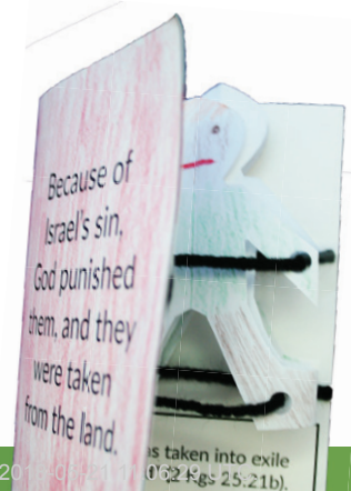
Exile Pop-Up See Year 2 Craft Book, Book 2

Directions: Before class time, make a paper-man chain by folding an 11x 4.5-inch piece of paper lengthwise into an accordion shape. Trace the template on the craft page onto the strip, and cut out the shape. Unfold the accordion; it will make a chain of four paper men. Punch holes in the hands and feet. (Make enough chains so each student has one). Pre-cut card and verse from craft sheet. During class have children decorate the men. Thread yarn through the holes. Glue one half of each end person to the inside. Glue the verse inside the card.