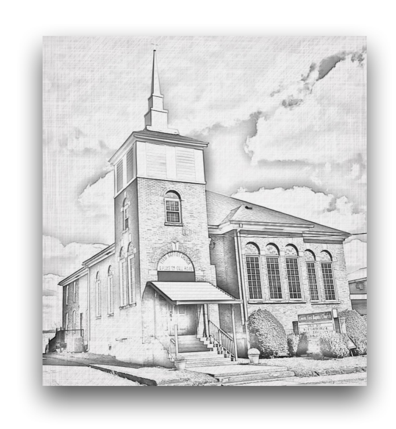
Worship Service December 24, 2023