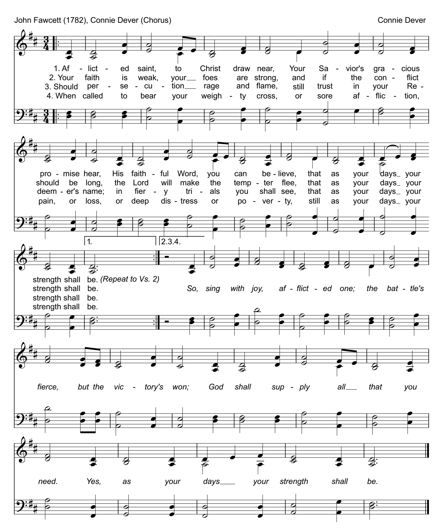
© 2018 Praise Factory Music (ASCAP)/Sovereign Grace Worship (ASCAP). Sovereign Grace Music, a division of Sovereign Grace Churches. All rights reserved. Administrated worldwide at www.CapitolCMGPublishing.com, excluding the UK which is adm. by Integrity Music, part of the David C Cook family. www.SovereignGraceMusic.org