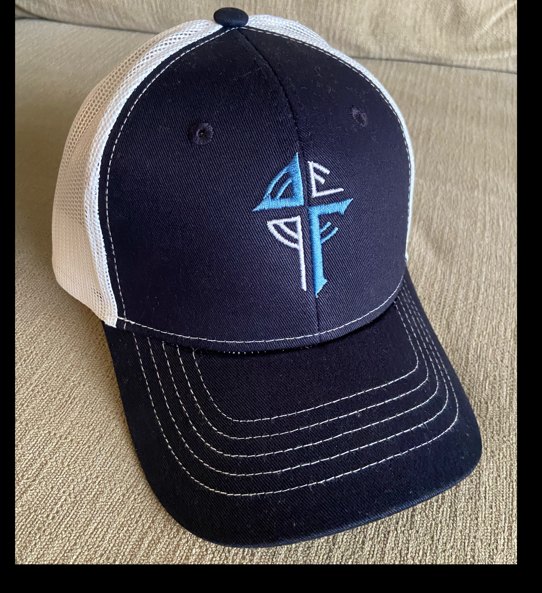
Faith Ball Caps $10