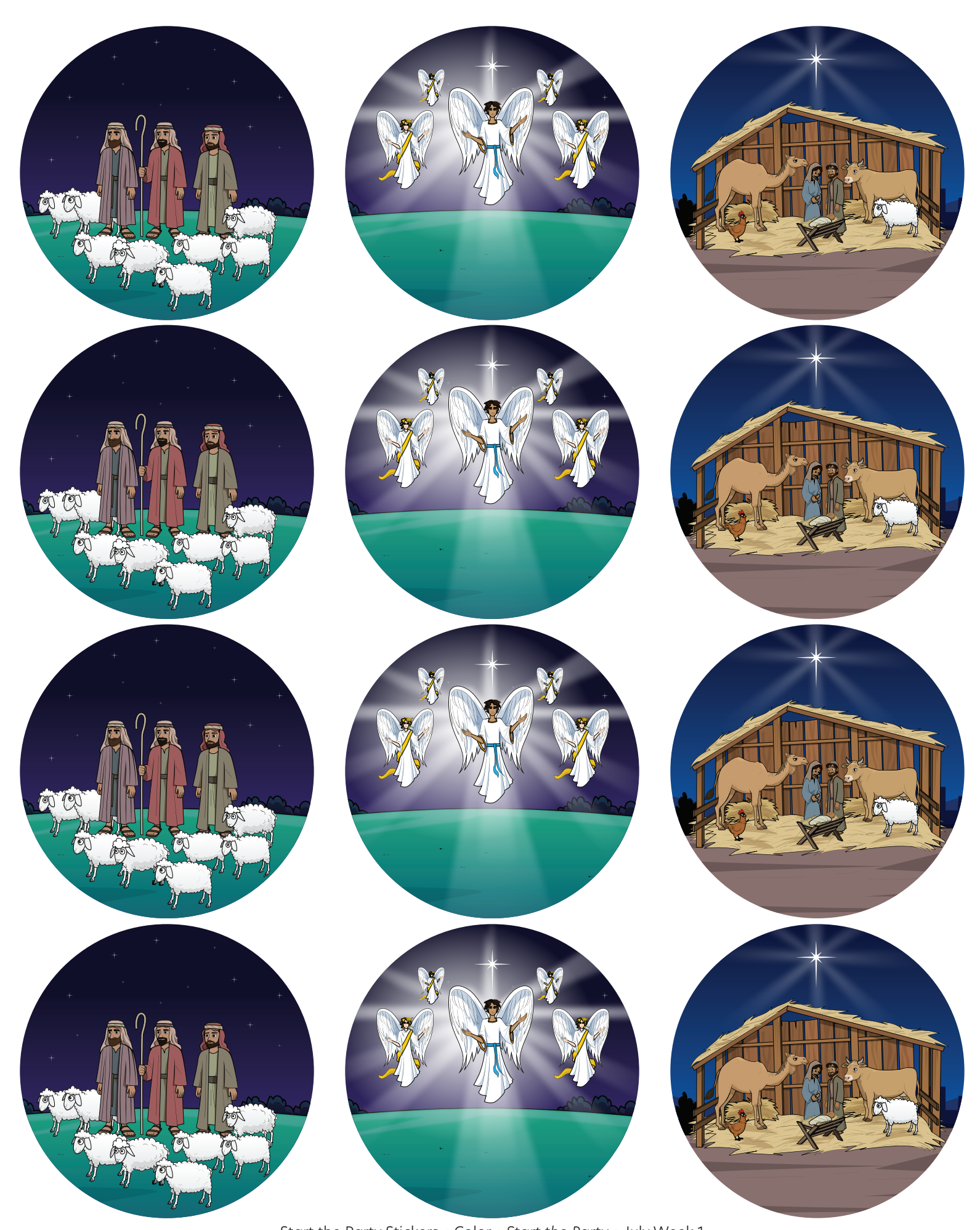
Start the Party Stickers • Color • Start the Party • July Week 1 Copy on Avery® #5294 or equivalent. One set per child. CURRICULUM FOR 3-5-YEAR-OLDS • ©2024 The reThink Group All rights reserved • www.ThinkOrange.com