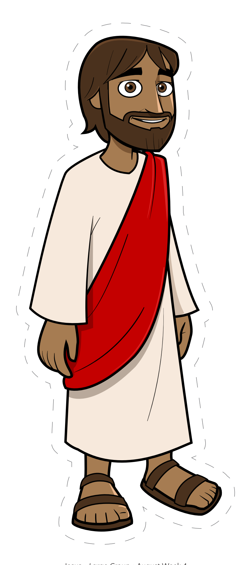
Jesus • Large Group • August Week 4 Copy on cardstock. One per Large Group. CURRICULUM FOR 3-5-YEAR-OLDS • ©2024 The reThink Group. All rights reserved. • www.ThinkOrange.com