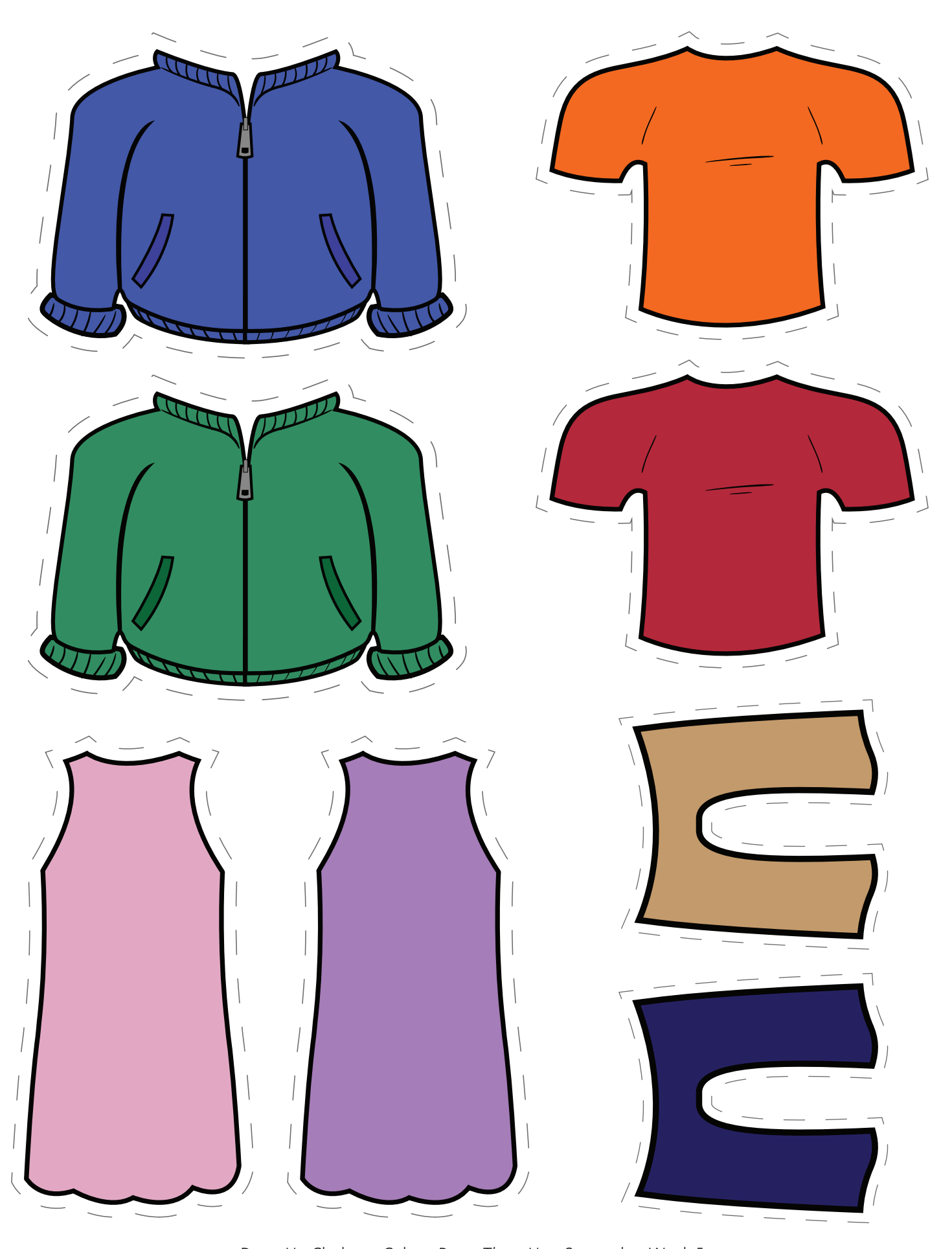
Dress Up Clothes • Color • Dress Them Up • September Week 5 Copy on cardstock and cut. One set for every two children. CURRICULUM FOR 2-YEAR-OLDS • ©2024 The reThink Group. All rights reserved. • www.ThinkOrange.com