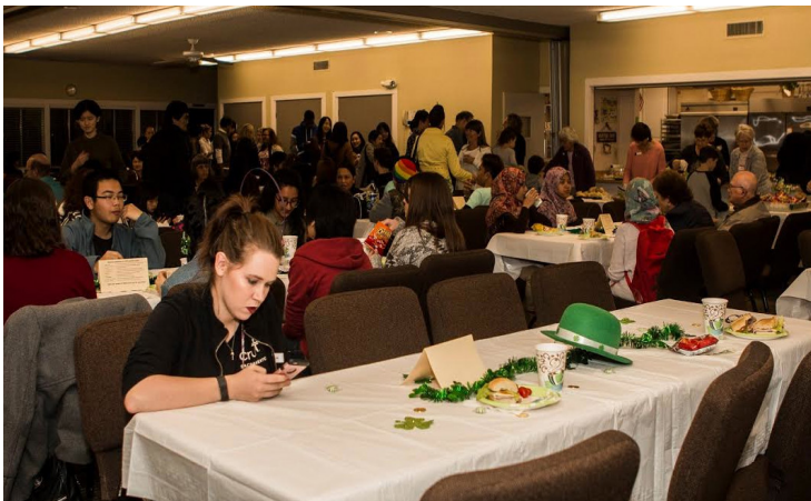
At least 180 were at the International Students Dinner...

But the students and volunteers started arriving and soon we had given out 180 name tags at the dinner, and more students came and went directly to the auditorium for the Maze show. Our student leaders were so excited to do something this faith stretching! Thank you for praying with us! Pray for those who heard the Gospel and believed that night to meet us for Bible study.