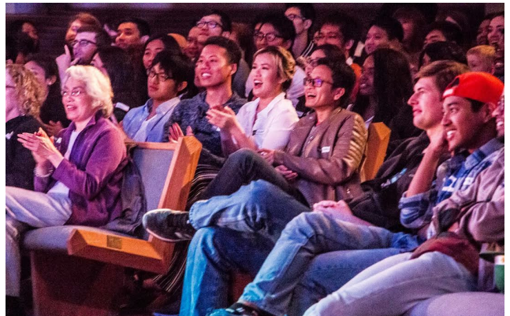
and even more came and went directly to the Maze!

Editor's Note: See the rest of this information on the wall in the church office. Their first grand-daughter was born and you can see her photo.