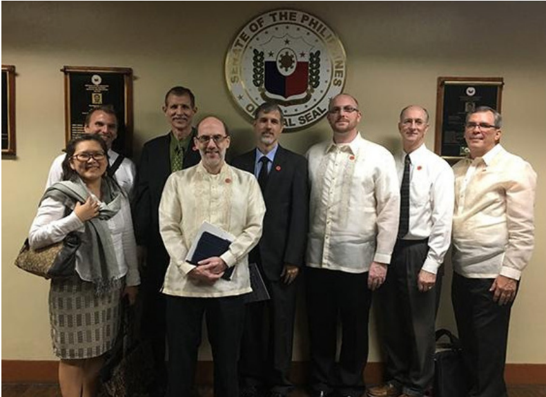
The Faith Academy team visiting the Philippine Senate to appear in the hearing.

The current government created a new type of recognition for international schools called "Educational Institution of International Character," or EIIC. This is the correct label we should have. To that end, we have embarked on a journey that feels impossible. We need to have a bill sponsored in both the Philippine House of Congress and the Senate, and once it makes it past those, then the President needs to sign it into law. A major milestone in this journey was achieved in February when I, along with seven others from the school, was able to appear in a hearing before a subcommittee of the Senate to promote our bill for consideration. The Lord granted us favor, and