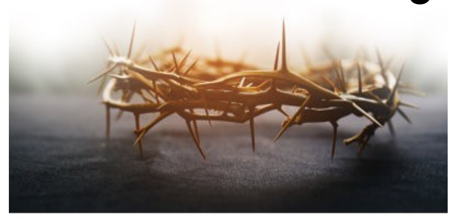
The Gospel of Mark