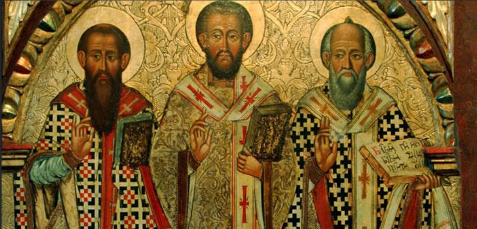
Cappadocian Fathers (AD 4 th century – Gregory, Basil, Gregory of Nazianzus)