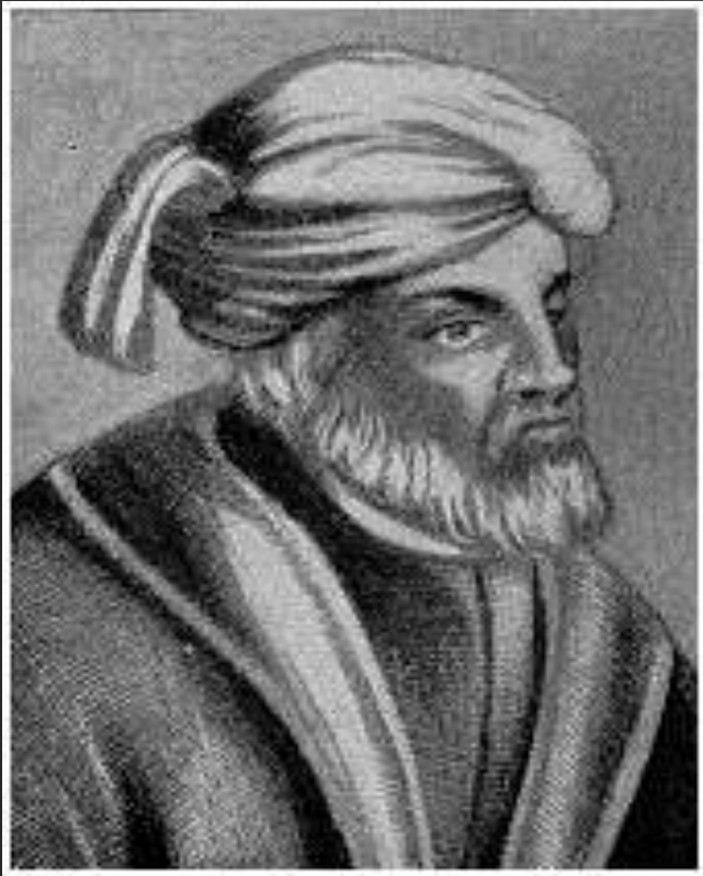
Tertullian (AD 155-225)