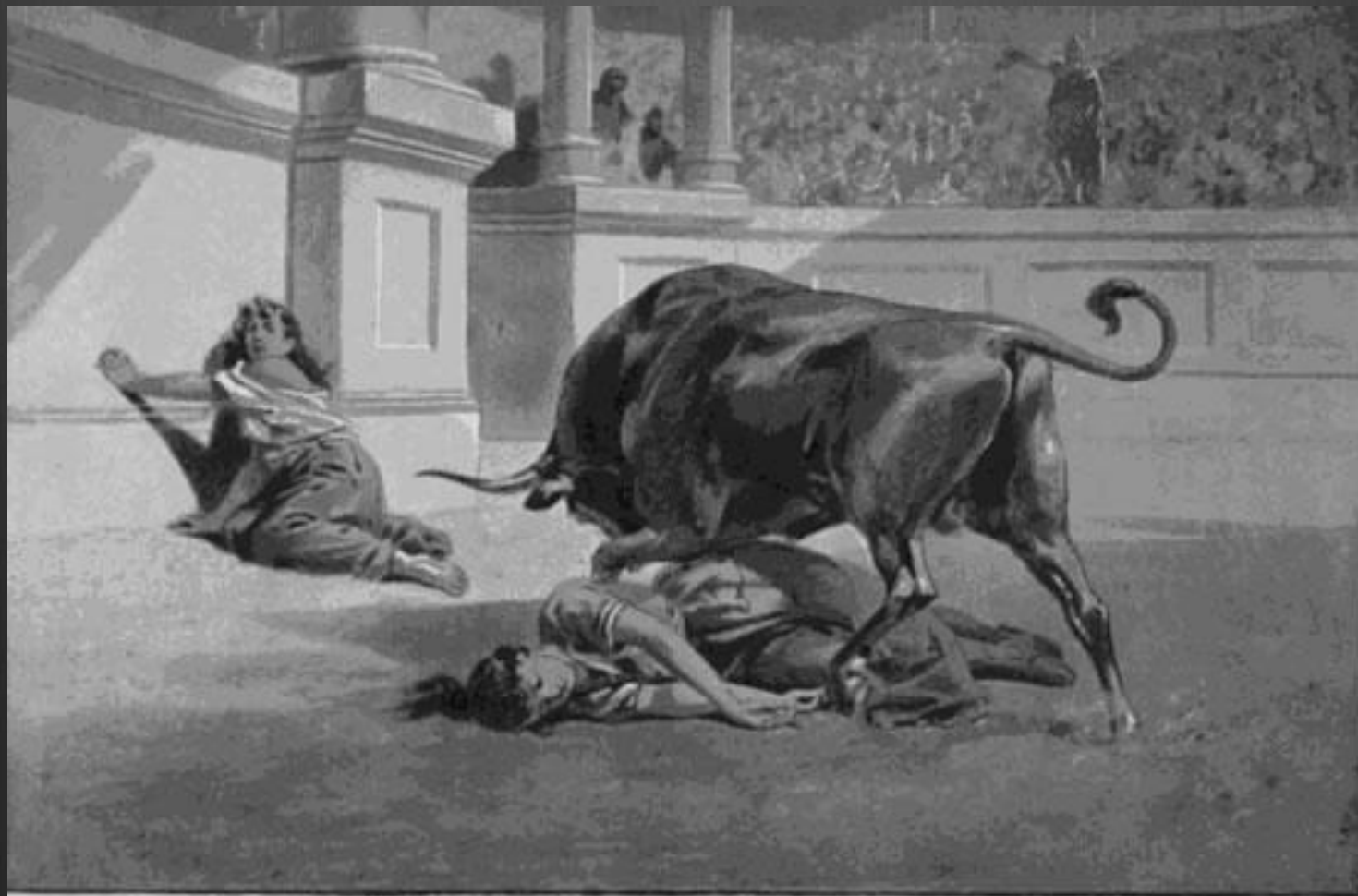
PERPETUA AND FELICITAS GORED BY A BULL IN THE ARENA.