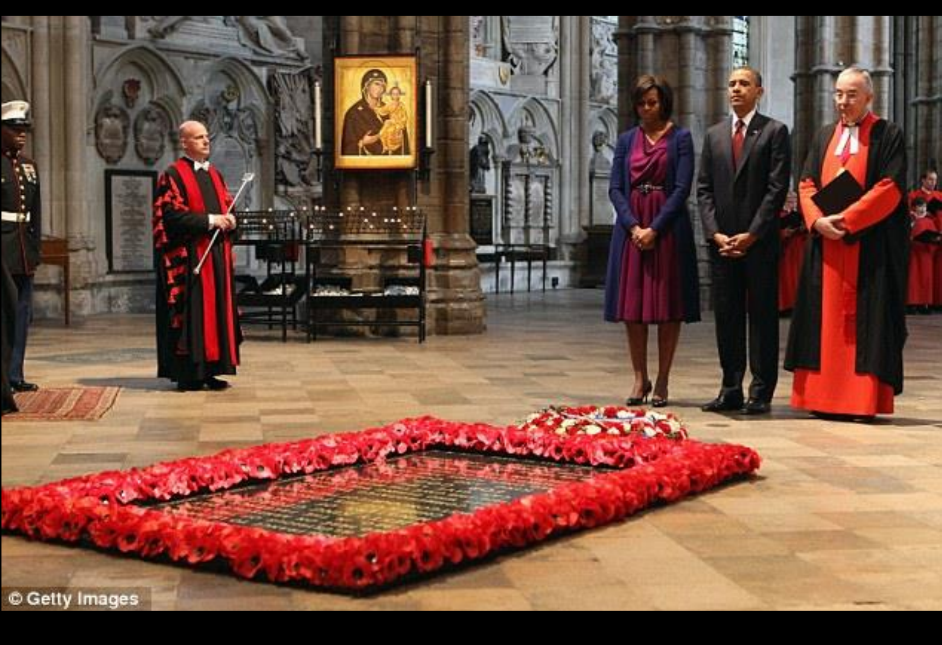
The British Tomb of The Unknown Warrior