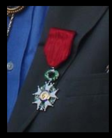
Knights of the French Legion of Honor