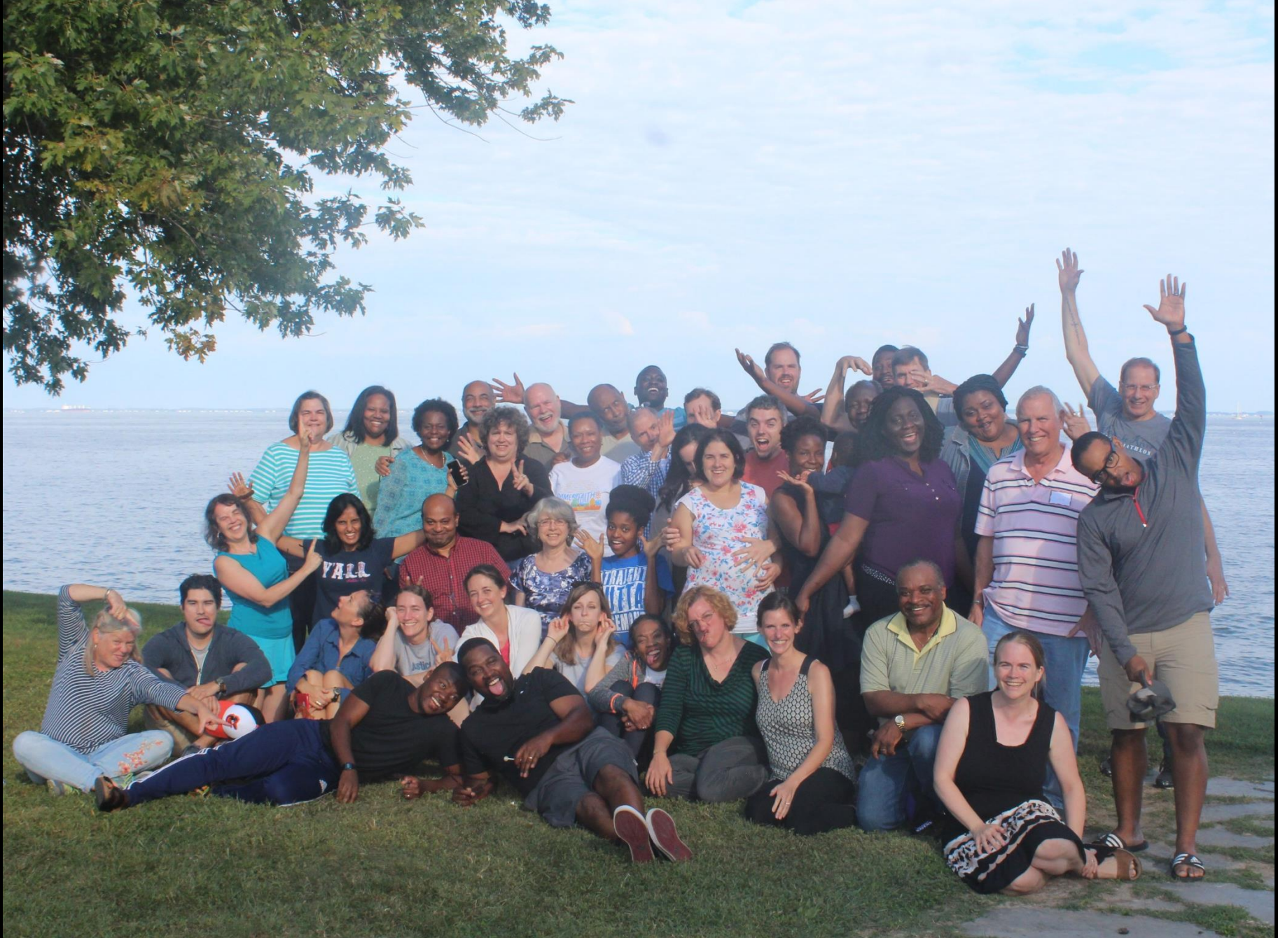
FCF Leadership Retreat - Fall 2017