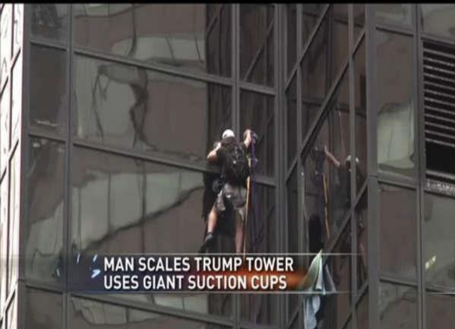
MAN SCALES TRUMP TOWER USES GIANT SUCTION CUPS