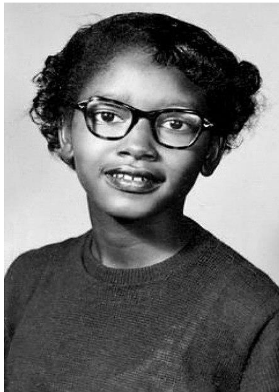
Claudette Colvin, 1954