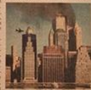
SCHOOL PLANS United Addison Higher 179

Then an American Alelines Booling TST laft Washlaguon's Dollars International Airport bound for Lan Acgolins, but motored hir the semmen part of the Pentagon, the military handquarters where $4,000 people work, at $40 a.m. Studiy, Unated Airlines Flight 50, a Booming 737 Styling from Newsek, he Sam Francisco,