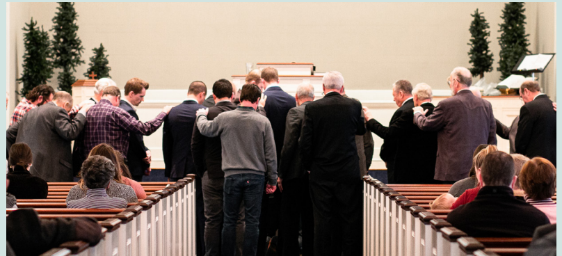
Installation Sunday 2024