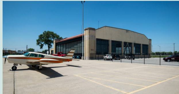
Lansing Municipal Airport