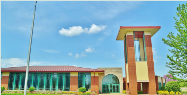
Mid-America Reformed Seminary