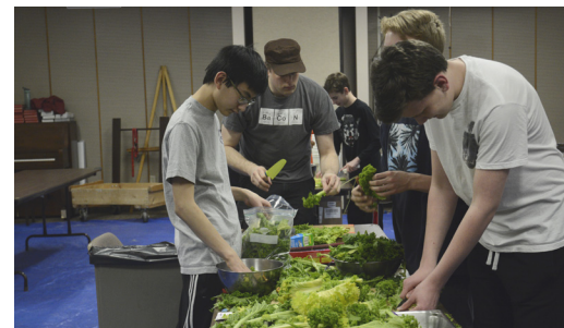
Students and volunteers at TOC 2017

Make a reservation today! Visit firstfreechurch.org/toc