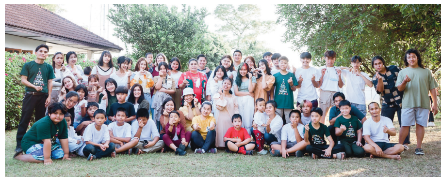
Children's Homes, Staff, & College Students