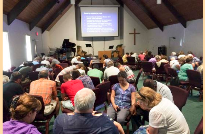
Attendees form small groups to pray for specific needs.