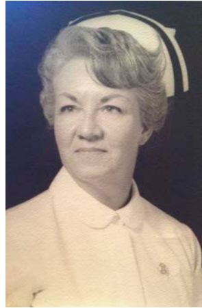
Nursing photo taken in 1966